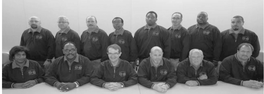
The 2011 UAW Chrysler National Negotiating Committee