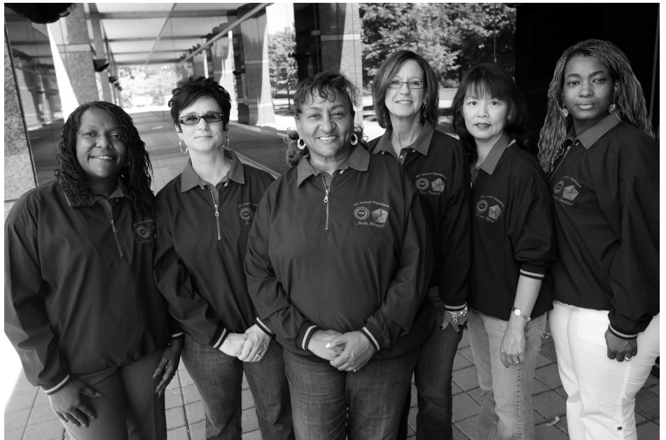
UAW Chrysler Department clerical support, all members of OPEIU494.

Dues are determined by UAW Constitutional action and are not a subject of negotiations. Dues are based on the principle that they reflect each worker's cash income, normally two hours' pay per month. Lump-sum cash payments are subject to dues because they too represent cash income, and are assessed at the traditional rate of 1.15 percent, which is equivalent to two hours' pay per month.